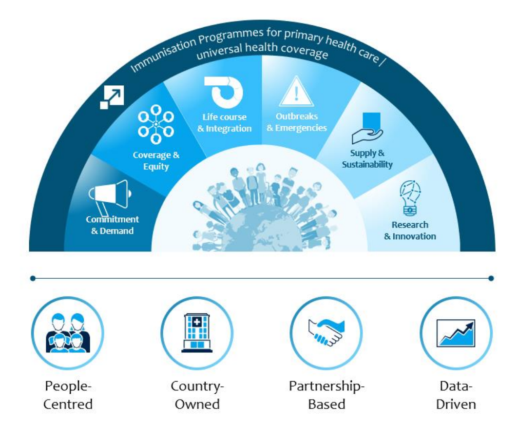
Fig. 2. The seven strategic priorities of IA2030

The first, overarching strategic priority is to ensure that immunization programmes are an integral part of primary health care to achieve universal health coverage. The second is commitment and community demand. These two strategic priorities are the basis of an immunization programme and are essential to deliver people-centred, demand-driven health services to individuals and communities.