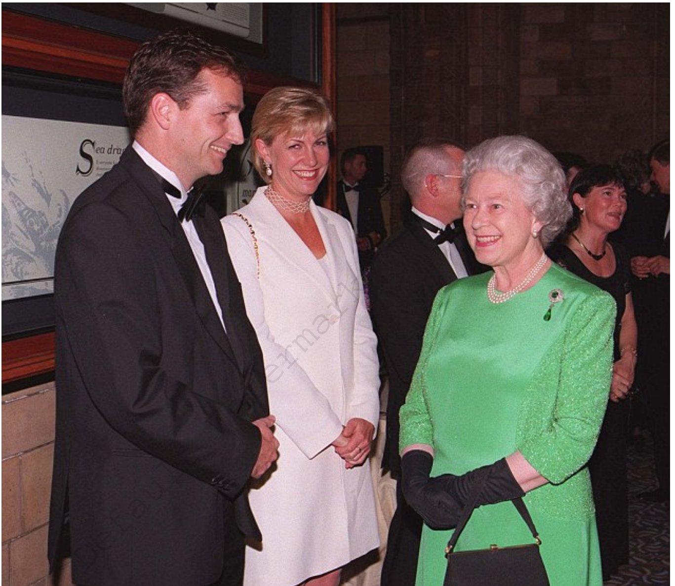
Alan Farthing, Jill Dando meet the Queen; Celebration of Scouting at the Natural History Museum in London