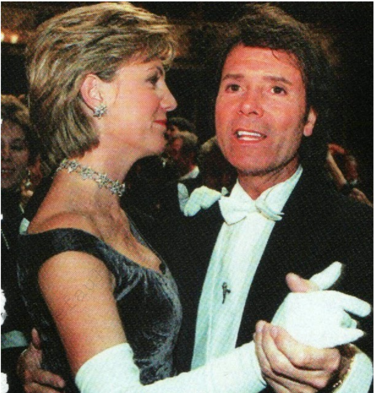
Cliff Richard and Jill Dando