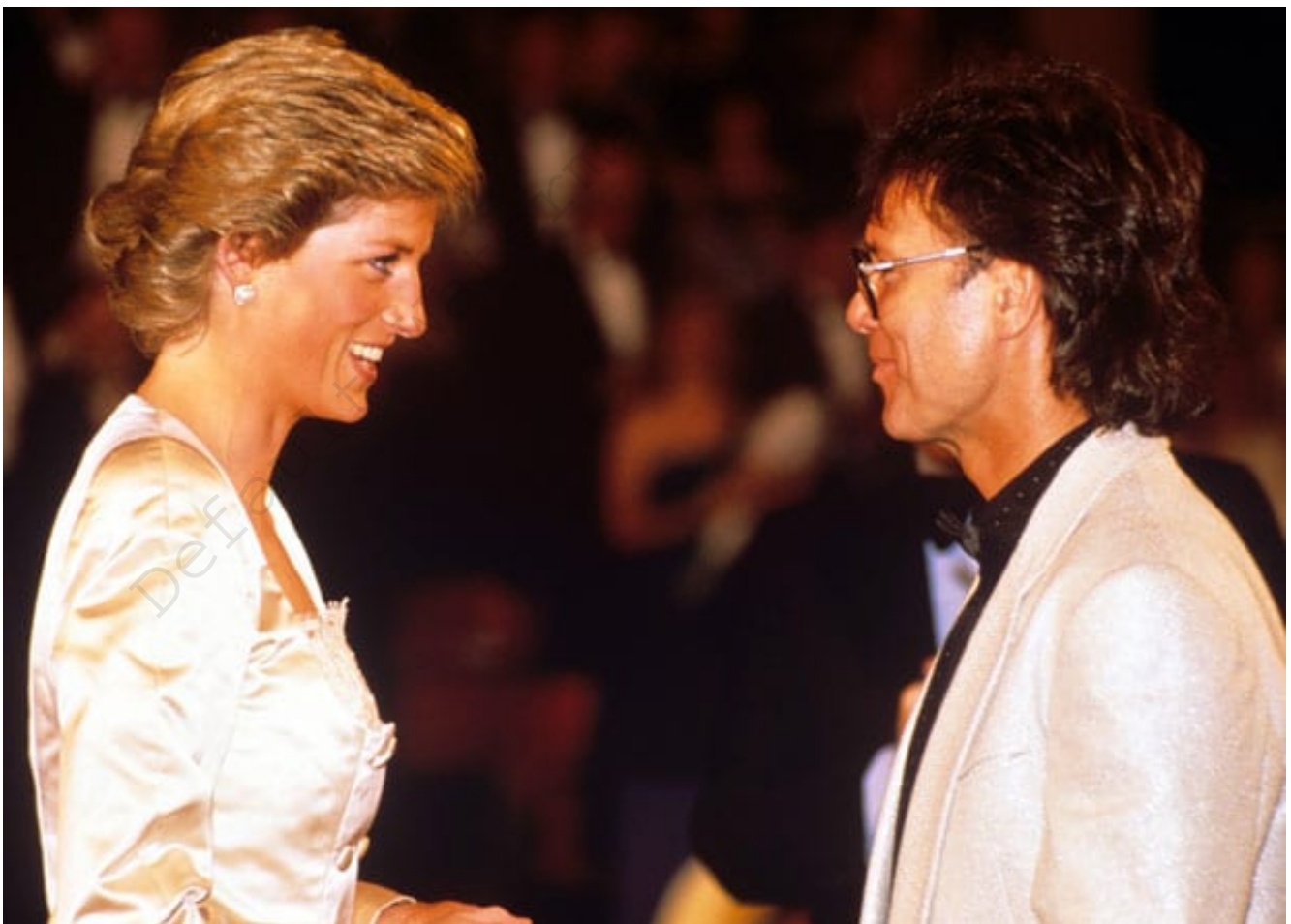
Cliff Richard and Princess Diana